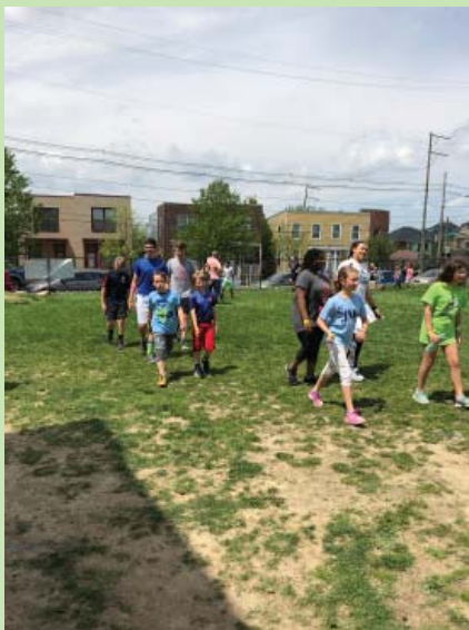
The weather was great for Techno Trek.