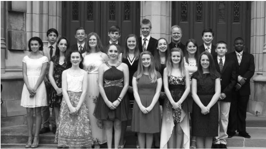
SJMS Class of 2015

Our friends from the Class of 2015 are moving on to college this fall from four exciting years in high school. Here is a list of their future plans.