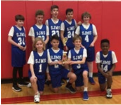
SJMS Boy's Basketball Team