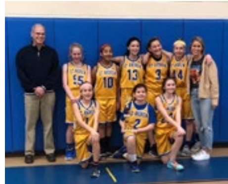
St. Mary's Girls Basketball Team