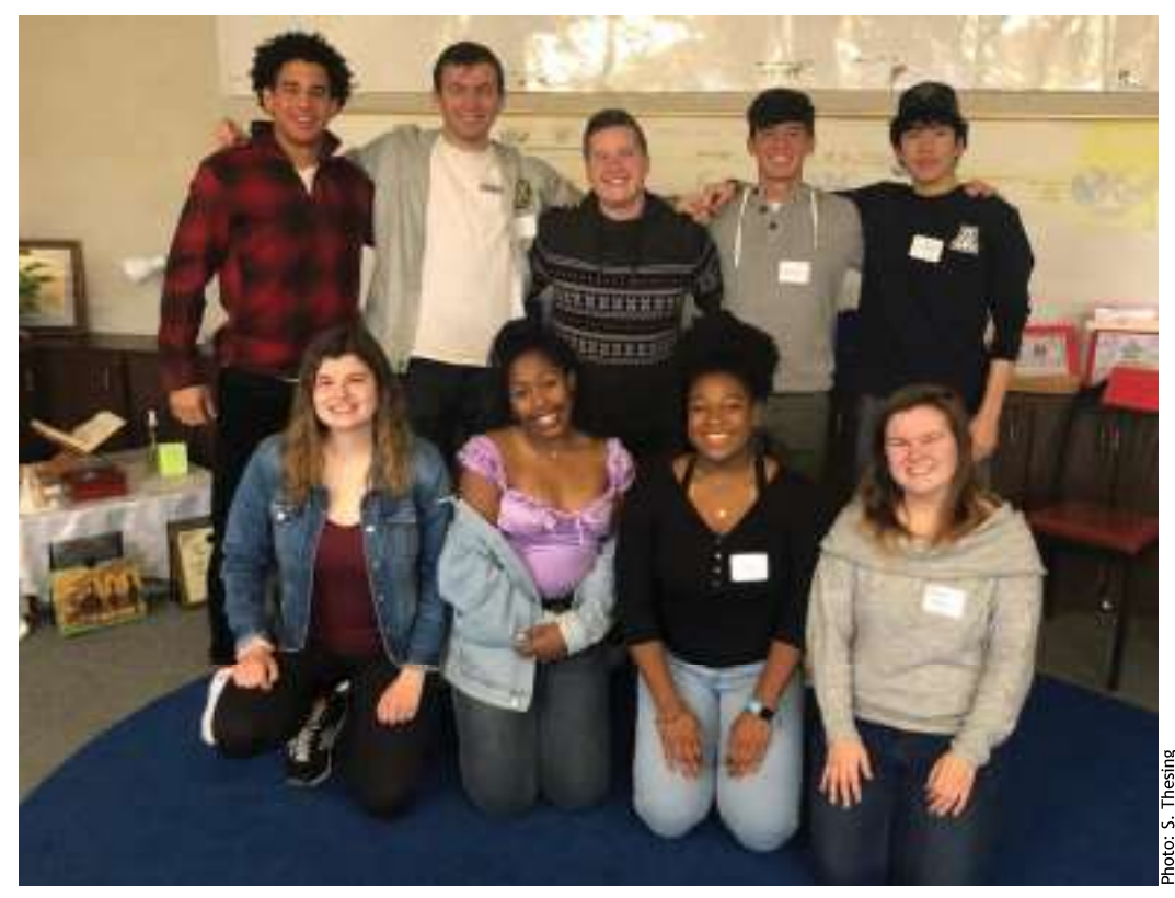
The Class of 2016 returned to SJMS for the alumni brunch.