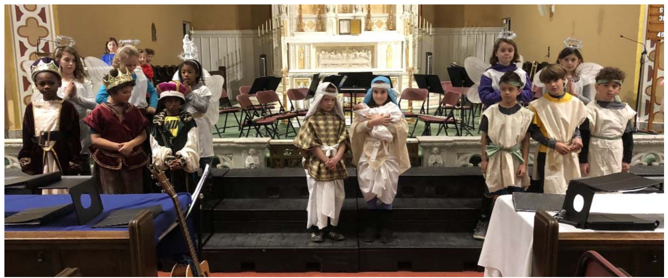
Our third grade students performed a Christmas Tableau that recreated the night Jesus was born.

On December 13th, Sacred Heart Church was filled with Christmas spirit during our annual Cookies and Carols concert.