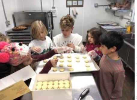
SJMS students helped bake the cookies for the event.

Our Bell Choirs performed many Christmas favorites for the audience.