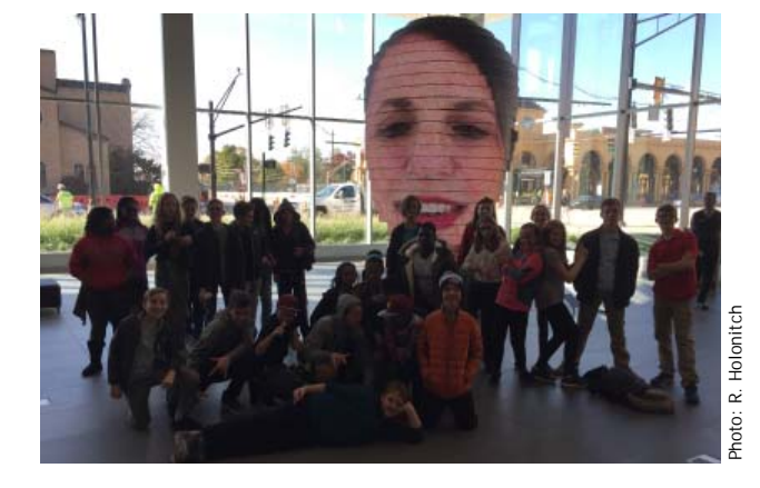
Our Erdkinder class posed in front of the giant 3D head. This digital artwork in on permanent display, and families are encouraged it get it a try!

On November 9th, our Erdkinder students ventured down to the Greater Columbus Convention Center to see the new art installation entitled, "As We Are." This is an interactive display that uses 27 individual images of your face and transposes it to a giant 3D head. Most of our students became part of the show by getting their pictures taken.