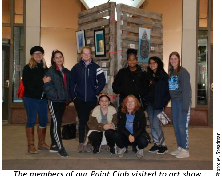
The members of our Paint Club visited to art show located at the Ohio EPA offices downtown.

National Recycling Day 2019 was an exciting event for SJMS students. The Ohio EPA hosted an artshow that featured artwork from local artists, as well as the work created by our Middle School class.