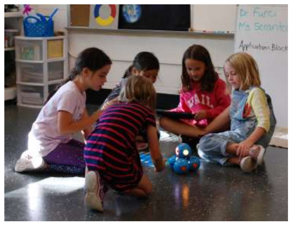
The members of our HER Academy work with coding and robotics.

This year, the girls in our Lower Elementary level have an opportunity to experiment with computers and coding, thanks to a program called HER Academy.