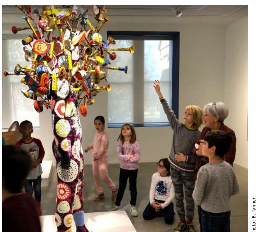
Students in LE1 saw amazing contemporary art on this trip.

Our students were engaged and participated in lively conversations with the gallery's docents.