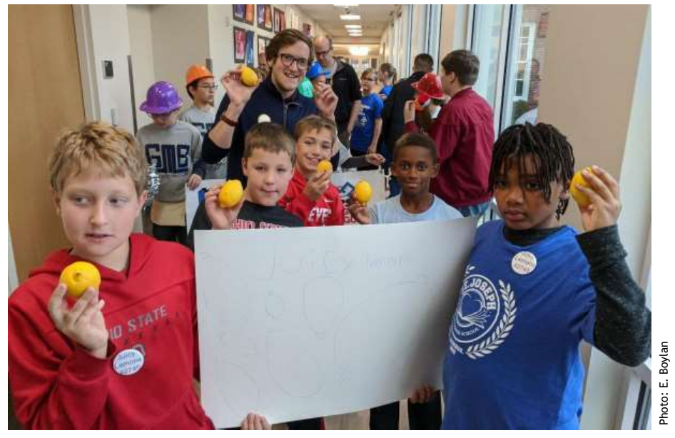
The Juicy Lemons enjoyed the LEGO challenges.

In November, the SJMS LEGO League team "Juicy Lemons" competed in the Marburn Academy Regional Qualifier. LEGO League, an after school club, allows students to engage in STEAM activities and use innovation to problem solve, learn teamworking skills, and be creative. The rookie team achieved a high score of 220 points in the robot game, presented their innovative solution to dangerous railroad crossings (robotic cranes and magnets!!), and ensured everyone who wanted a lemon went home with one. To cap it all off, the team won the Breakthrough Award!!