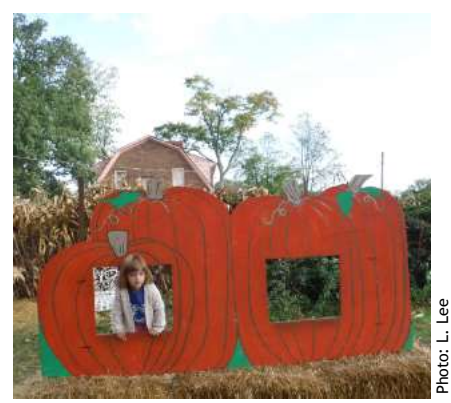
Children' House students, including Aiden Kenney (CH1), enjoyed Circle S Farms.