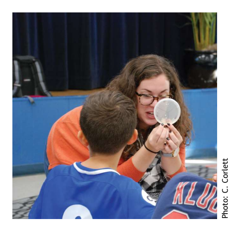
Students investigate microbe samples with students from OSU.

In each presentation, students received new lessons with many hands-on experiments.