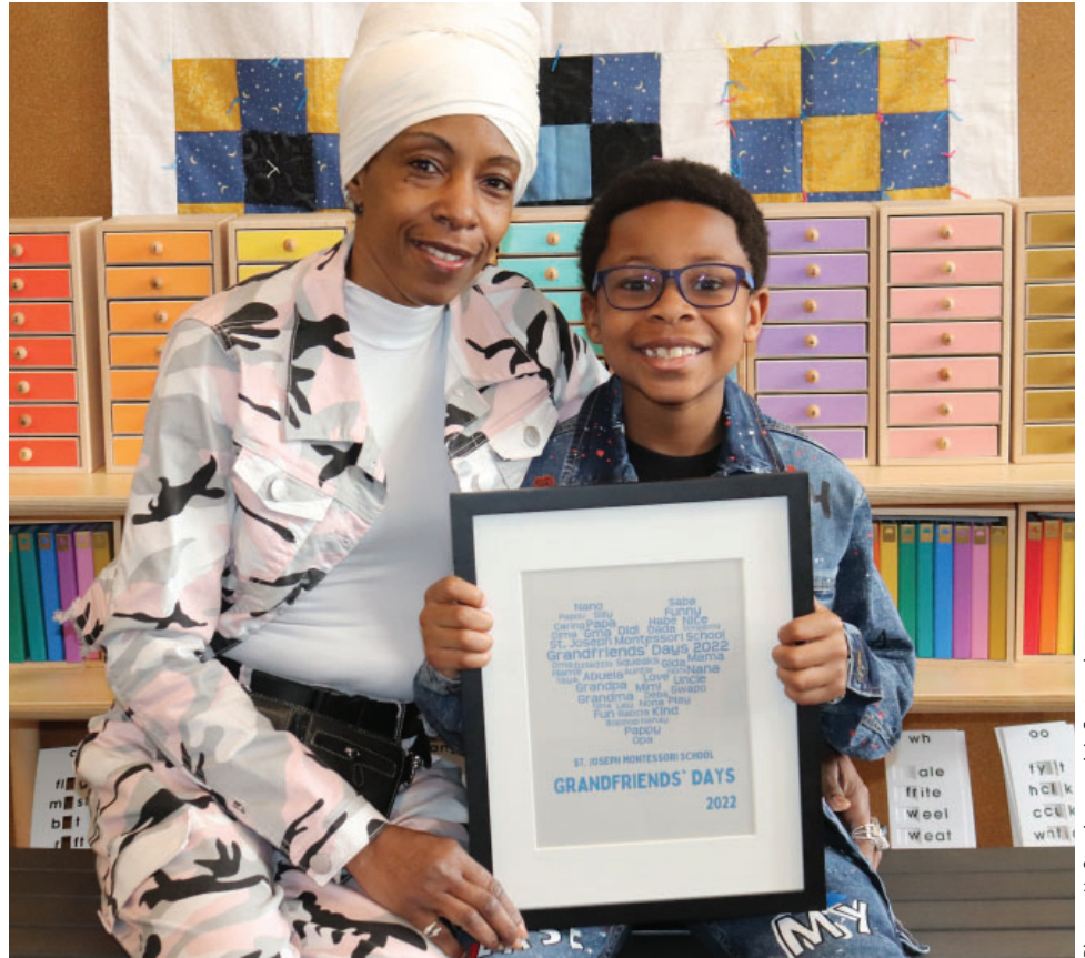
Students and grandfriends were so happy to share these special days together at St. Joseph Montessori School.