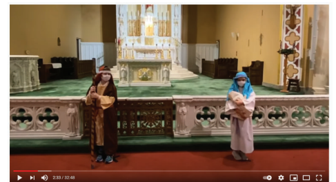
The Tableau was filmed in Sacred Heart Church.