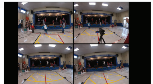
Each Children's House classroom filmed their songs in Ryan Hall.