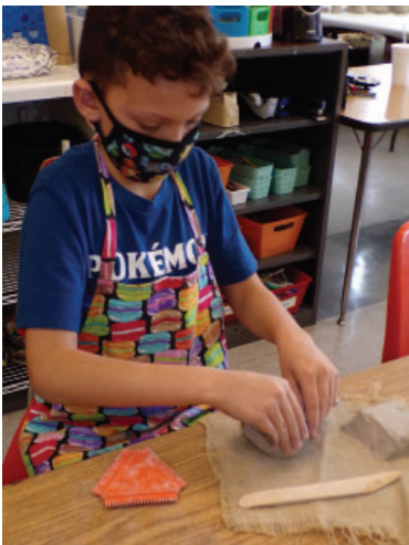
The students in Upper Elementary created a piece of pottery using the coil technique.