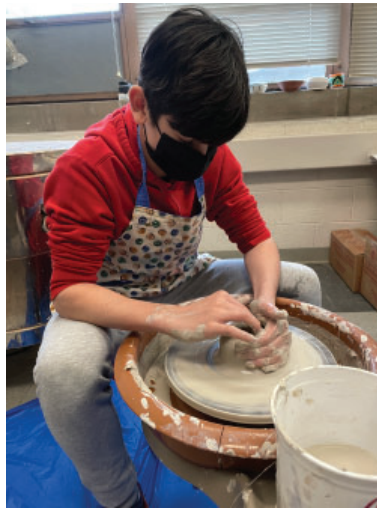
Our Middle School students each signed up for a chance to throw clay on our potter's wheel.