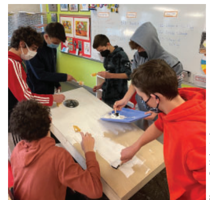
Our eighth year students used their time to volunteer with our specialists and create their legacy gift.