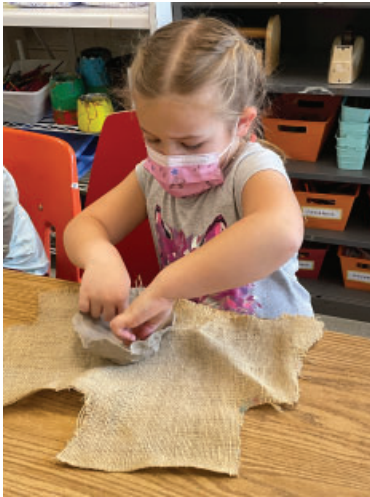
Children's House-Third Years created pinch pots with their hands to build fine motor skills.