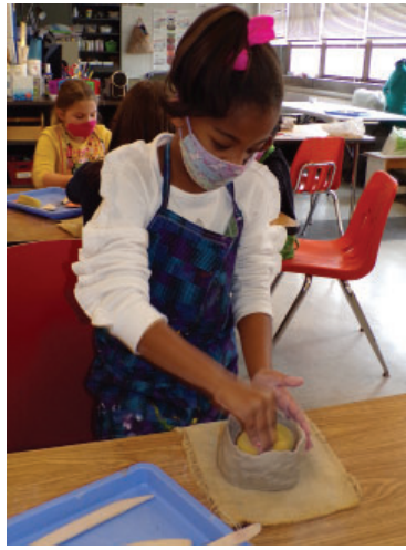
Artists in Lower Elementary also made pinch pots, but experimented with clay tools.