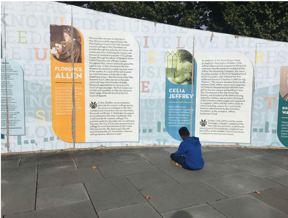
During their visit, students reflected on the information displayed on the wall.

During the week of November 15th, students in our Upper Elementary and Middle School levels used their Religion classes to visit the Washington Gladden Social Justice Park. The park is located downtown on the corner of East Broad Street and Cleveland Avenue. This is the first park in the nation dedicated to the theme of social justice.