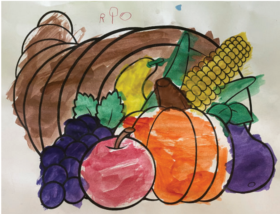
Rio (CH4) painted a cornucopia in art class to celebrate Thanksgiving.

This time of year, we reflect on all the gifts we are given each day. To celebrate Thanksgiving, we asked our Lower Elementary 3 class to share what they are thankful for.